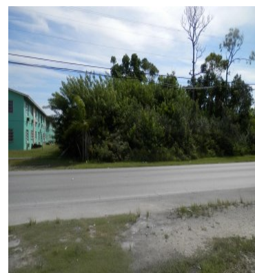
SEE THIS PROPERTY ON THE MAP