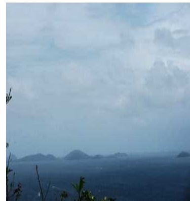
SEE THIS PROPERTY ON THE MAP